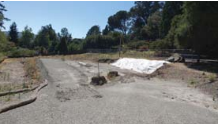
Station 43: Nothing to see here.

wo rebuilt Lamorinda fire stations are set to open in 2018, but both properties may be put into service later than originally planned.